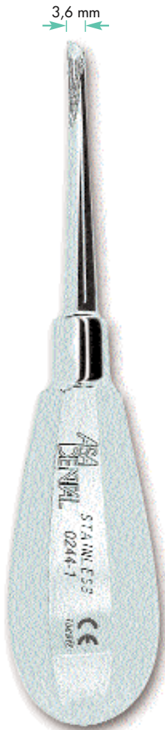
0244-1 Fig. 1K Kopp

■ Con manico in acciaio inossidabile With stainless steel handle