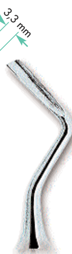
0219-2 Fig. 2