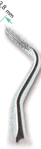
0244-6 Fig. 6K Kopp