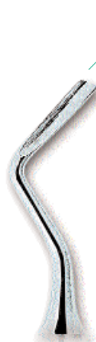
0219-1 Fig. 1