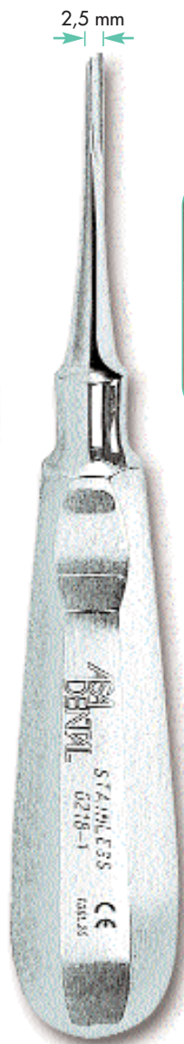
0218-1 Fig. 1