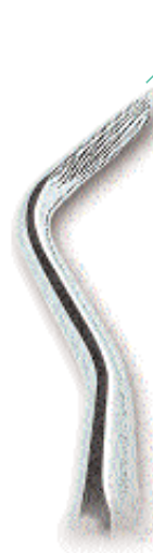
0244-5 Fig. 5K Kopp